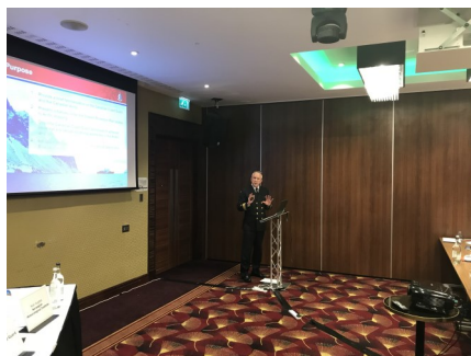
2017 US Coast Guard Presentation in London, UK