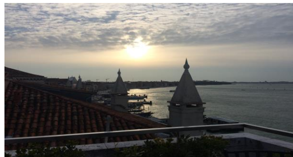
European Fuels Markets & Refining Strategy Conference 2018, Venice, Italy