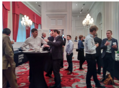
Networking at European Smart Homes 2017